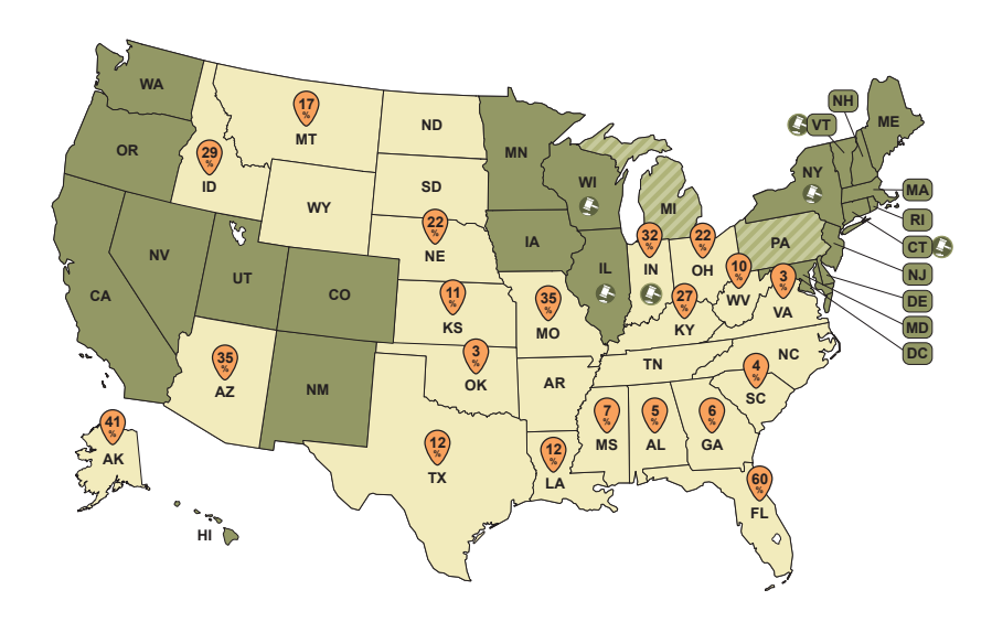
Figure 2a: Sexual Orientation Protections Through Federal Circuit Court Rulings, State Laws, and Local Nondiscrimination Ordinances