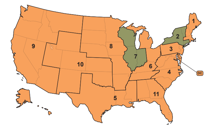
Figure 3a: Currently, the Second and Seventh Circuits hold that discrimination based on sex includes discrimination based on sexual orientation