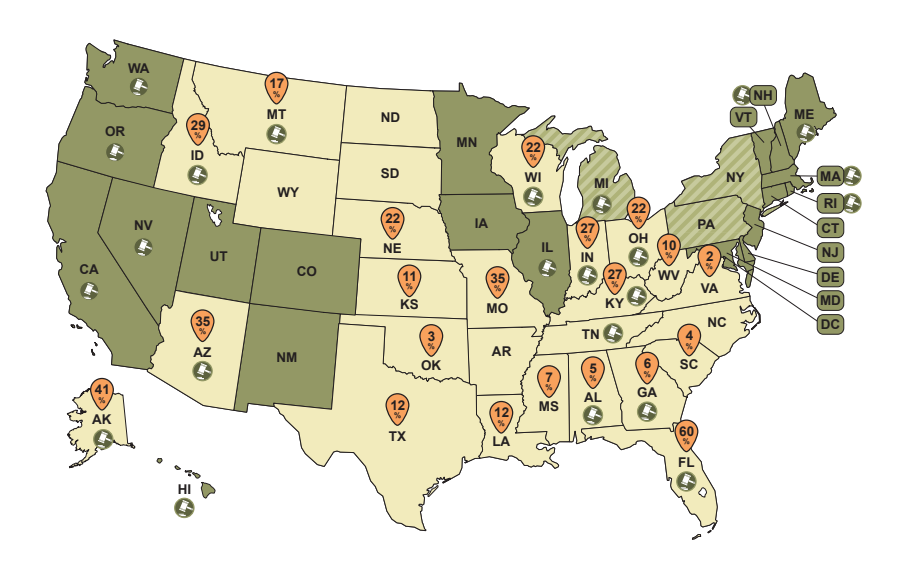
Figure 2b: Gender Identity Protections Through Federal Circuit Court Rulings, State Laws, and Local Nondiscrimination Ordinances