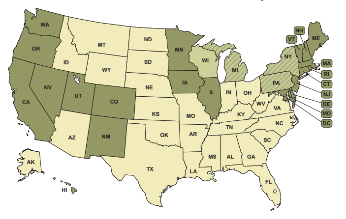
Figure 4: Many States Have Protections Against Employment Discrimination Based on Sexual Orientation and Gender Identity

Just as the EEOC and federal courts have come to understand the ways in which discrimination against LGBT people is, in fact, sex discrimination, several states have similarly advanced protections against discrimination based on gender identity (New York, Michigan, and Pennsylvania) and sexual orientation (Michigan and