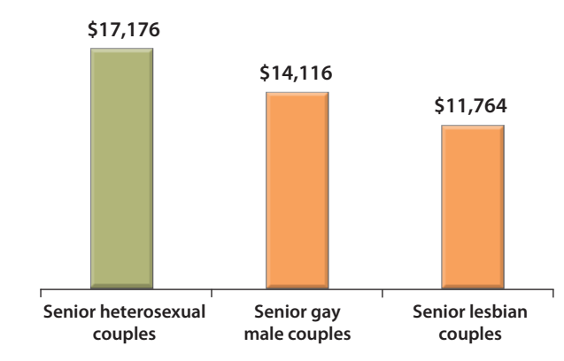
Figure 3: Annual Social Security Income of Older Couples 2005/2006

Source: Goldberg, Naomi G. "The Impact of Inequality for Same-Sex Partners in Employer-Sponsored Retirement Plans,"The Williams Institute, May 2009