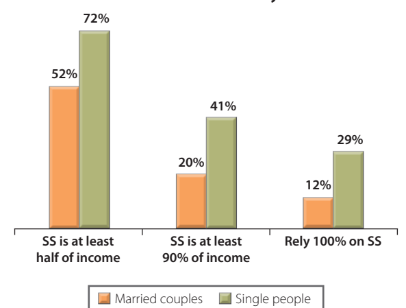
Figure 1: Percentage of Households with High Reliance on Social Security Income

Source: 2006 Figures; "A Profile of Older Americans: 2008," Administration on Aging, U.S. Department of Health and Human Services, 2008.